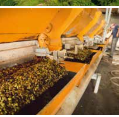
Above: The Maya ruins of San Andrés. Middle: The sun-rich country sees its future in green energy. Below: Besides coffee and sugar, El Salvador is known for cacao of high quality.

Regardless of the fact that his critics accuse him of hardly respecting the checks and balances, the young president enjoys a profound consent among the Salvadorian citizens who seem to respect him for doing "the right thing". His intuition had led to an early and very strict shutdown in March due to the Covid pandemic, so far resulting in a low number of cases.